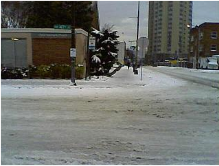
Seattle was hit with major snowfall Jan. 18-21 and the church was closed mid-week. Several events were cancelled and are being rescheduled. SHARE was given permission to stay inside during the worst of it.